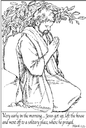
Very early in the morning... Jesus got up, left the house and went off to a solitary place, where he prayed. Mark 1:35