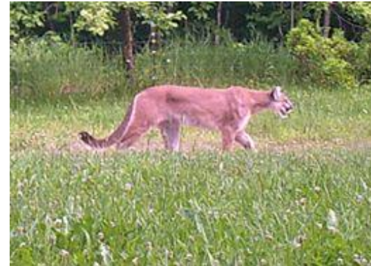
Mountain Lion seen in the Western UP this Summer

CLOSING HYMN: 50 – "Lord, Dismiss Us with Thy Blessing"